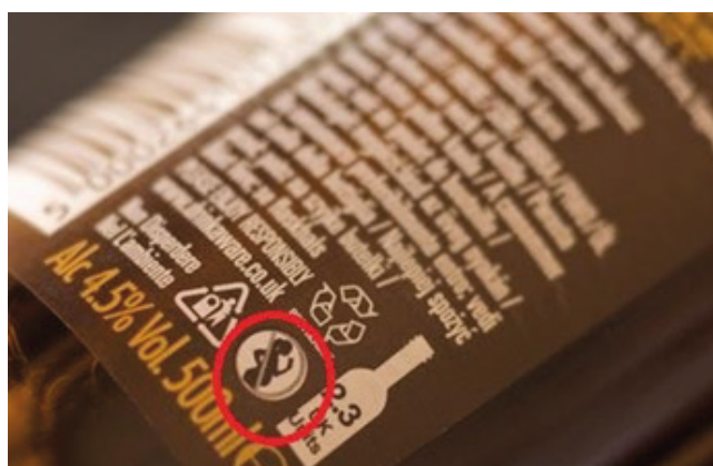
Fig. 4. Pregnancy pictogram in France

If pictograms are used, it is preferable that they are accompanied by a corresponding health information message. Furthermore, as on tobacco products, the specific size of the health information could be determined as a minimum percentage of the size of the container. The images used can be informational in style and taken from other ongoing education campaigns to enhance their effectiveness. Noticeability would be increased by placing the image on a contrasting background, with warnings printed in red rather than black (41).