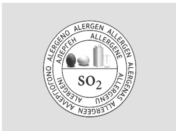
Fig. 3. Required allergen pictogram for wine

information provided to consumers, the listing may be accompanied by pictograms (40). However, the EU regulations only require listing of the most common allergens. Some people might be allergic to substances that are not considered common. Unlike for food products, ingredients listings for alcohol products are not obligatory. Hence, consumers cannot easily track whether or not ingredients they are allergic to are contained in alcoholic beverages. Requiring alcoholic beverages to list ingredients would substantially improve provision of information to consumers and allow them to track potentially problematic products.