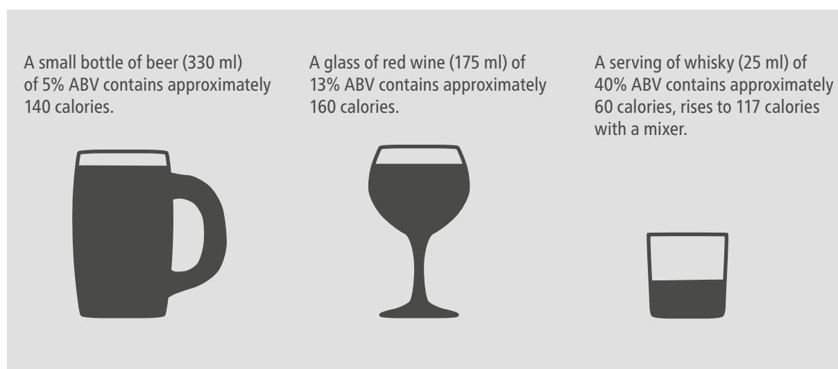
Fig. 2. Calorie content in beer, red wine and whisky