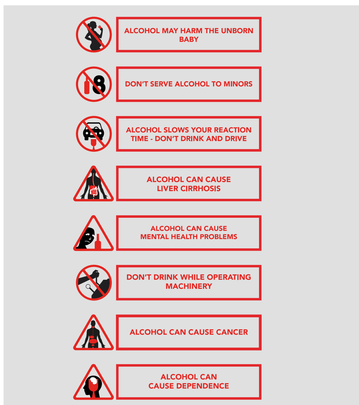
Fig. 5. Examples of warning text and pictograms for alcoholic beverages

by the United States public following its introduction. Similarly, pregnant women who saw the labels were more likely to discuss the issue; in addition, a “dose–response” effect was found such that the more types of information the respondents had seen (on adverts at point of sale, in magazines and on containers), the more likely they were to have discussed the issue (43). In France, comparable results were found in relation to the introduction of the pictogram in 2007 (Fig. 4). A study of public awareness regarding the dangers of drinking alcohol during pregnancy indicated a positive evolution in terms of changing the social norm towards “no alcohol during pregnancy” (46). Furthermore, information label messages may serve to legitimate a socially challenging intervention, such as increasing activities that aim to reduce the likelihood of an inebriated person driving a vehicle.