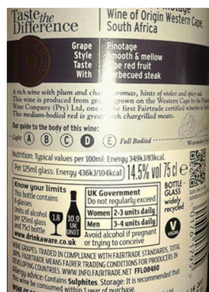
Fig. 6. Wine label in the United Kingdom from a supermarket's own brand

In addition, there is a growing acceptance of the key role that governments play in positively influencing consumers' dietary choices; to do so, they may use a range of preventative health approaches, including food labels where appropriate (3). Unfortunately, studies from the United Kingdom have found that a voluntary pledge by industry to provide information on the calorie content of alcohol did not lead to any significant provision of such information to consumers (47). Fig. 6 shows one of the few examples of a label produced in accordance with the pledge. Product-labelling regulation is an important instrument in promoting healthier habits and public institutions are ideally positioned to utilize it.