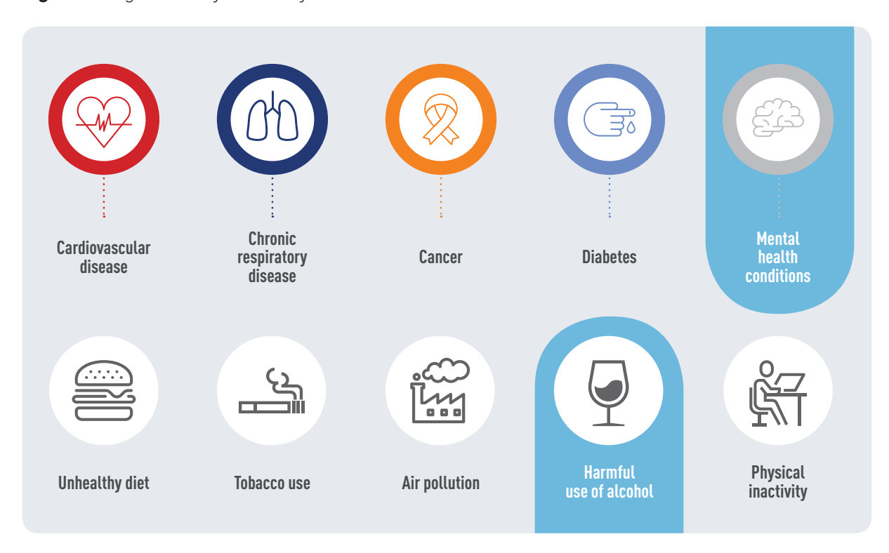
Fig. 1. Moving from "4 by 4" to "5 by 5" noncommunicable diseases

Furthermore, the goal of promoting mental health to reduce the onset or exacerbation of NCDs is clearly identified in the Action plan for the prevention and control of noncommunicable diseases in the WHO European Region 2015–2025 (2). The rationale for the new political declarations can be seen in the strong links and common features of mental health conditions and other NCDs: