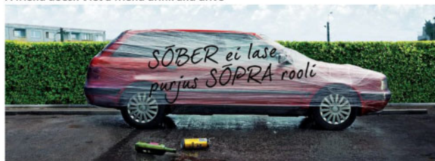
A friend doesn't let a friend drink and drive

Source: Public campaign by Road Safety Administration.