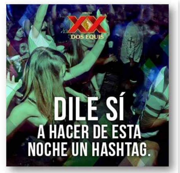
Social media advertisement. "Say yes to making this night a hashtag."

In 2014, ANPAA documented an increasing number of website advertisements for alcohol— an average of 40 per month, twice as many as