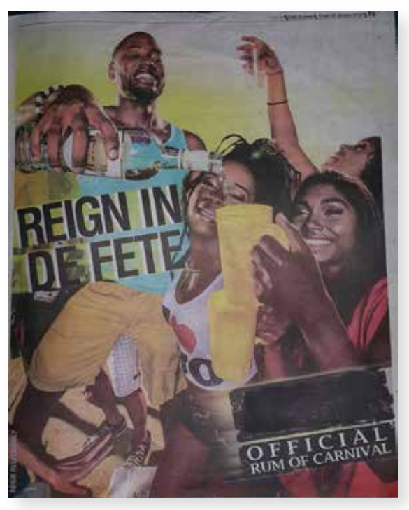
Advertisement in Trinidad and Tobago.

Because marketing can reach everyone, codes for responsible marketing practices (including selfregulatory codes) have been established to protect vulnerable groups from exposure to media messages that promote the consumption of alcoholic beverages.