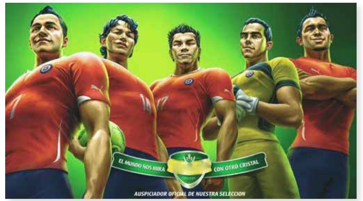
Advertisement in Chile.

It has been recommended that 1) children and adolescents; women of childbearing age; and people who choose to abstain from drinking or should not drink for health or other reasons<sup>*</sup>) should be protected from exposure to alcohol marketing and 2) children and adolescents should receive additional protections far beyond the self-regulatory codes and partial bans that have been established in many countries.