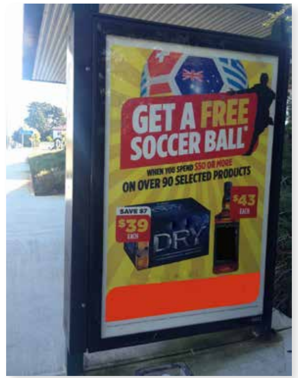
Bus stop advertisement from Australia.

Although monitoring relies on audience self-reports to media measurement companies, self-reporting is the "currency" of purchasing decisions for billions of