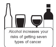
FIGURE 1 Alcohol health warning labels presented to interview participants

You are more likely to die from heart disease if you are a heavy drinker