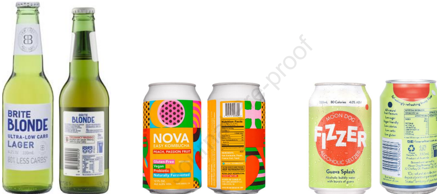
Figure 2: Example products with full nutrition information panels shown to participants during the focus groups